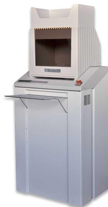
W/D/H 75 x 55 x 180 cm